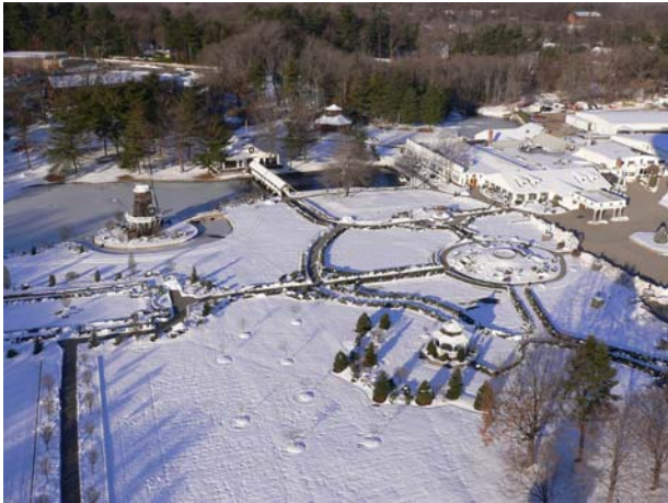
Snowy Aquaturf from the air...