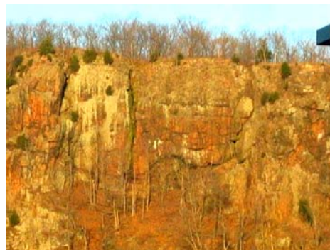
The old man in Meriden Mountain